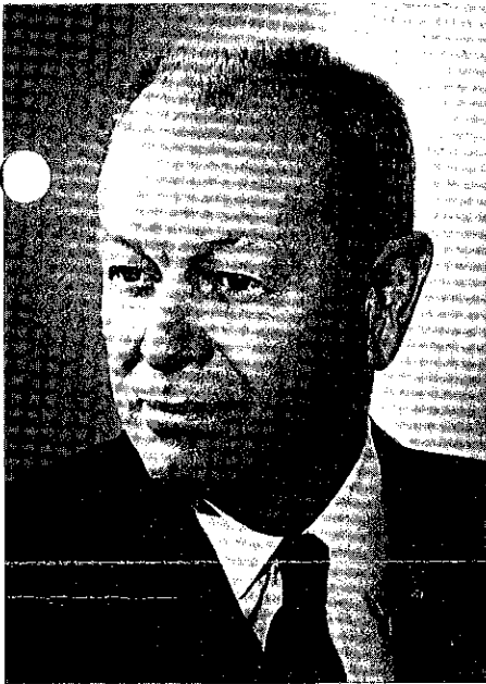
CHAIRMAN OF THE BOARD