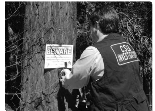
CSLB Enforcement representatives post signs throughout burn areas reminding consumers to "Look for the License" and warning unlicensed operators that working in a declared disaster area without a license is a felony.

Early outreach sent a strong message during last year's fire season. CSLB did not receive a single complaint from victims of either the Angora Fire near South Lake Tahoe, or the various Southern California wildfires. ■