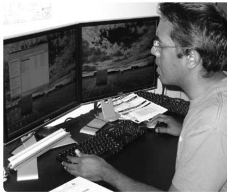
CMEA grants enable students to have the latest computer systems and software.

California State University, Chico receives the highest distribution since it has the largest CM program in the state (and one of the largest in the nation) with 715 students. The university received $67,000 from CMEA in Fiscal Year (FY) 2004/05, and $81,409 in FY 2005/06. Compared to figures in the overall university or state budget, it may seem insignificant, but it does make a difference.