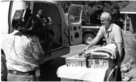
Computers and records from the Aquarius business office were confiscated as part of the investigation.

The CSLB and Sacramento County District Attorney’s Office investigation of Imperial Pools (dba Aquarius Pools) of Sacramento (License #267176) began after the company abruptly halted operations in August 2006, leaving more than 60 families with partially completed swimming pools. CSLB received initial complaints and inquires from homeowners and subcontractors who filed more than 60 mechanic’s liens against the homeowners for unpaid work.