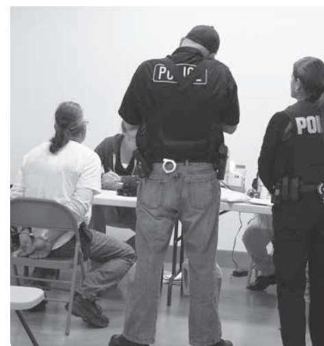
CSLB Enforcement staff question a suspected unlicensed operator at a March 2013 sting in Oakdale.

Contractors are required to accurately report their number of employees to EDD, and have 20 days to notify EDD of any new hires. However, since workers' compensation costs rise with the number of employees, some contractors knowingly underreport their employee counts. CSLB has authority to take action against contractors who fail to abide by EDD's requirements, and will pursue violators. Also, failure to maintain appropriate workers' compensation insurance coverage can result in license suspension and additional sanctions. 🏠