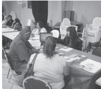
Above: CSLB Enforcement staff assist communities affected by natural disasters.