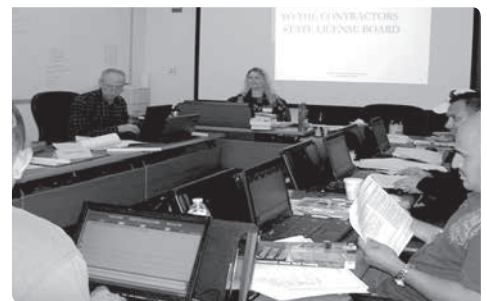
Licensed contractors serve as Subject Matter Experts during CSLB examination development workshop.

Licensees interested in participating as a SME must be the qualifier for the license