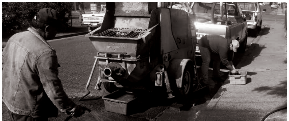
This construction crew was among those checked by CSLB investigators during a recent Saturday sweep in Vallejo.