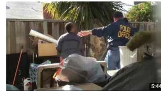
California Blitz- Hayward Highlights by Contractors State License Board · 182 views · 3 weeks ago

CSLB's YouTube Channel received 3,922 views between September 20, 2016 and October 19, 2016, an average of 140 visits per day. Viewers watched a combined total of 13,528 minutes of video. During this same time, CSLB gained 30 followers on YouTube, growing from 555 to 585.