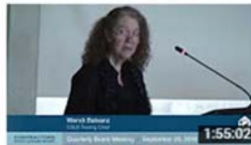
Board Meeting Day 2- 9/20/16

PAO added a lower third graphic to display during Board and Committee meeting live streams. The new design displays CSLB’s logo, the meeting date, agenda item, and the name and title of each CSLB official. This element makes it easier for viewers to follow along during the meeting and find content in archived videos.