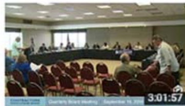
Board Meeting Day 1- 9/19/16

A live webcast was provided for the quarterly Board meeting held in Monterey on September 19-20, 2016.