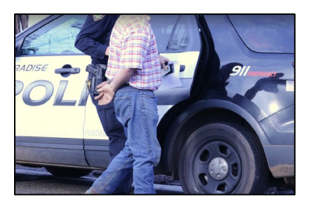
Video: Sting Recap & Sample of Media Coverage