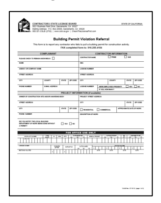
CSLB's Building Permit Page