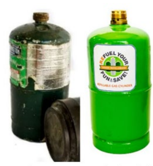
Single-use propane cylinders (left) are causing an environmental problem that can be solved using refillable propane (right).

CPSC says single-use propane cylinders are a growing environmental problem, with about four million being thrown away in California each year. Nationally, about 40 million are tossed out annually.